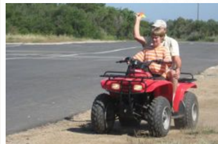
Safety Officer Being Safe (?)