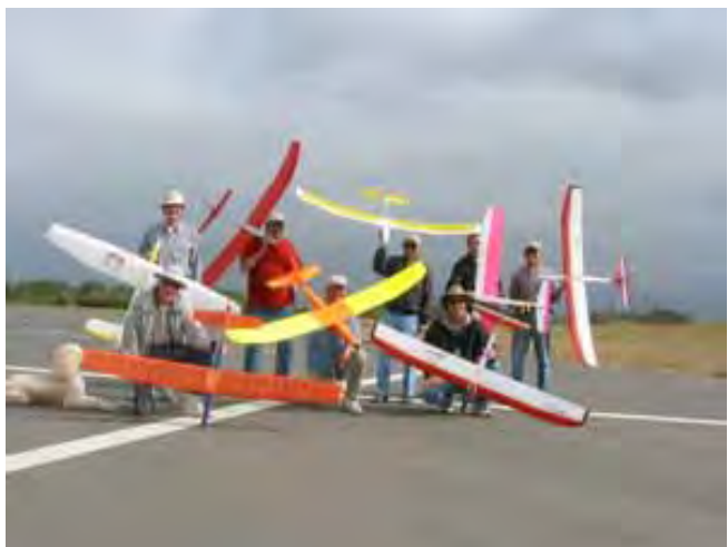
REMEMBERING THE GOOD TIMES OF 2005