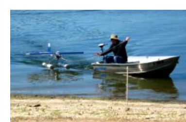
Beety Recovers Bonetti's Stick