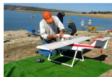
Stanley and Seamaster Type

Try not to drive more than 15 MPH on the entrance road to the field. It creates unnecessary dust and adds to the washboarding of the road.