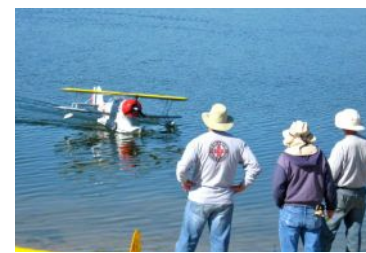
Duck Coming in for Feet Dry

Please remove your aircraft and equipment from the flight station after you have completed each flight. Its a SAM rule—check your Bylaws booklet, Page 13.