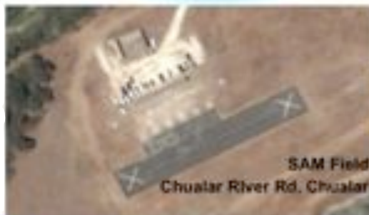
SAM Field Chualar River Rd. Chualar